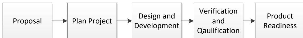
Figure 3 – Product Realization Process

The essential steps in product realization from planning through design and development are shown in below: